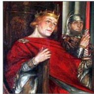
Henry II KING OF ENGLAND