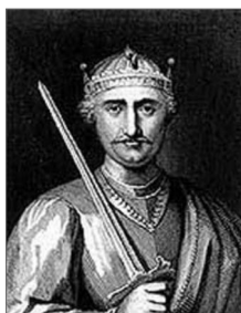
William I KING OF ENGLAND