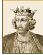
Edward I KING OF ENGLAND