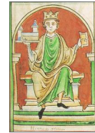
Henry I KING OF ENGLAND