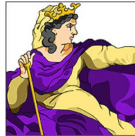
Matilda of Normandy EMPRESS OF ENGLAND