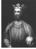
Edward II KING OF ENGLAND