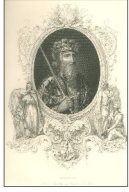
Edward III KING OF ENGLAND