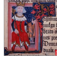
Henry III KING OF ENGLAND