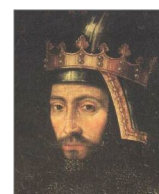
John of Gaunt DUKE OF LANCASTER